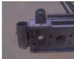
Guard Rail Post / Turnbuckle Adaptor